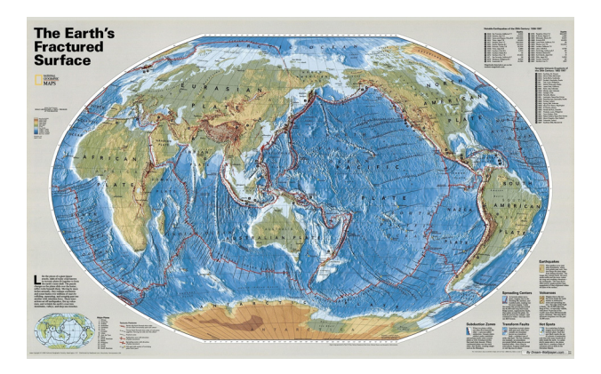
Figure 2. The Earth's Fractured Surface (The Earth's Fractured Surface, 1999)