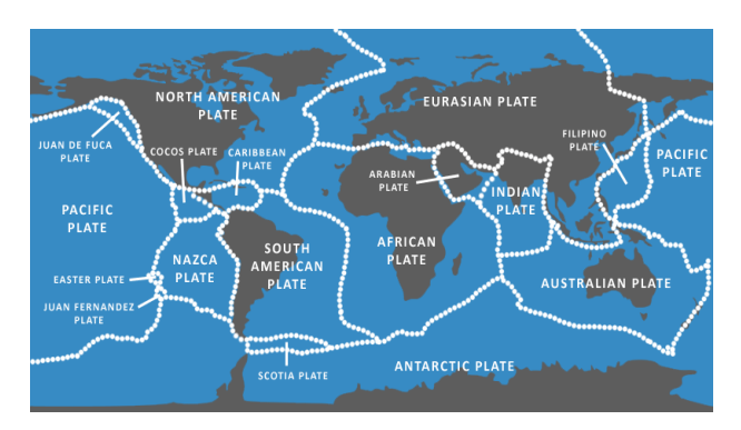
Figure 1. Plate map of the continents and the World Ocean floor (Plate Tectonics, 2016)

The formulation of a theoretical approach to the determination of gas hydrates deposits formation in the oceans was based, first of all, on the analysis and comparison of several aerial maps of the discovered gas hydrate deposits, maps of tectonic plates and Earth's fractured surface. The imposition of these maps shows and confirms the fact that the major part of these deposits are confined to these zones (Figure 1 - 3).