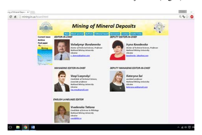
Figure 6. Editorial Board page of the journal

We have put up a new website – <a href="http://mining.in.ua">http://mining.in.ua</a>. Papers are published on the website of the journal on a daily basis. The website is in English and its artwork uses the same motifs as the new cover of the journal (Fig. 6).