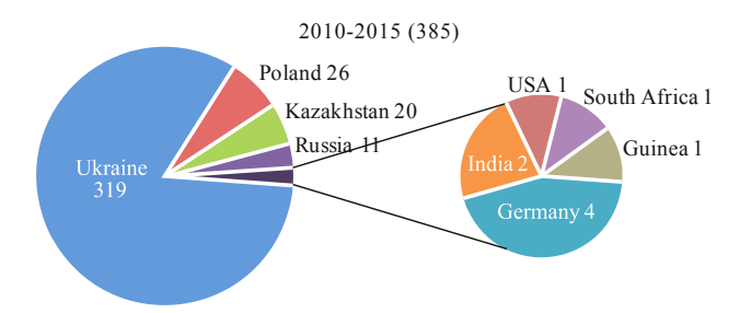
Figure 5. The total number of articles published by CRC Press/Balkema in Annual Scientific and Technical Collections

The main problem of these collections is that some of books are not listed in Scopus. We are now trying to submit once again and see if we can convince Scopus to include them. That is why we will not publish next scientific collections this year via CRC Press/Balkema.