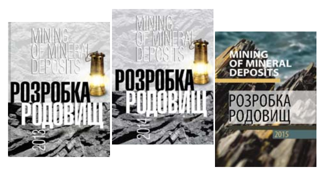
Figure 2. Covers of the last three volumes of "Mining of Mineral Deposits" (2013 – 2015)

"Mining of Mineral Deposits", issued since 2013, is continuation of the "School of Underground Mining" (Fig. 2). This collection is officially registered in Ukraine's Ministry of Justice. The register number is KB 20210-10010 P dated from 30<sup>th</sup> August 2013.