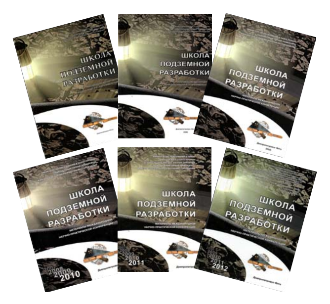
Figure 1. Covers of the previous editions of the "School of Underground Mining" (2007 – 2012)

Covers of the "School of Underground Mining" editions from 2007 to 2012 are shown in Figure 1.