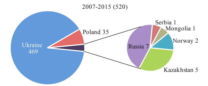
Figure 3. The total number of articles published in scientific and technical collections "School of Underground Mining" and subsequently "Mining of Mineral Deposits" by national background

Scientific and technical collection ("Mining of Mineral Deposits") contains materials from native and foreign experience of innovation technologies implementation in mining. Research studies of problems in mining are presented. The total number of articles published in scientific and technical collections of the "School of Underground Mining" and subsequently "Mining of Mineral Deposits" is 520 (Fig. 3). Changes in Editorial Board are presented in Table 1.